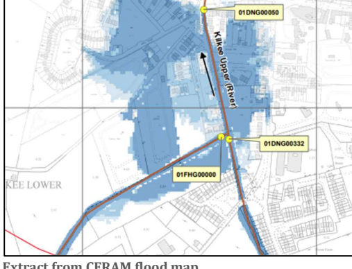
Extract from CFRAM flood map

We are beginning to look at<br/>options and discuss these with<br/>the various statutory<br/>undertakers to understandExtract from<br/>© Ordnance<br/>Licence Num<br/>Council.constraints that may restrict possible solutions.